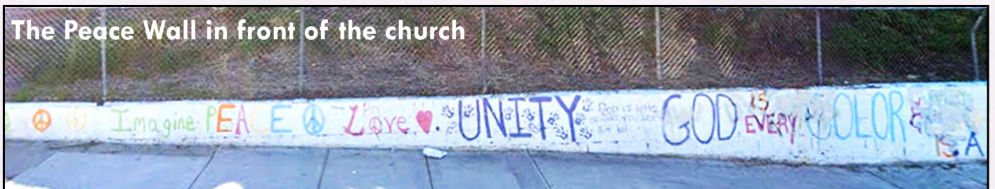
The Peace Wall in front of the church